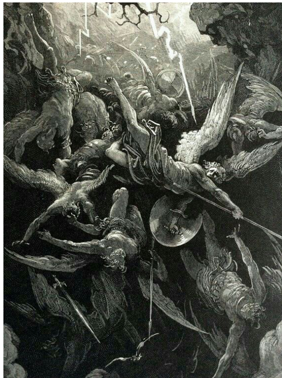
The War of the Sons of Light Against the Sons of Darkness