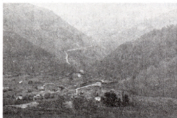
From its mountain setting, the small farming hamlet of San Sebastian de Garabandal looks down on the valley below.

showed a trace of muscle strain or fatigue. They were insensitive to pinpricks, burns with matches and physical contact. Even when bright spotlights were centered on their heads during night visions, the pupils of their unblinking eyes remained dilated. During their ecstasies, the weight of the girls became so excessive that two grown men had great difficulty in lifting one twelve-year-old girl. And yet, they lifted each other with the greatest of ease to proffer a kiss to the Blessed Virgin.