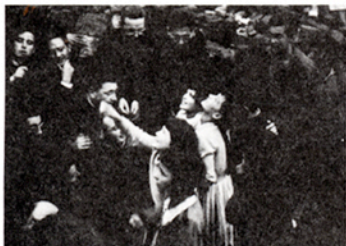
Many priests witnessed the young girls' ecstasies.