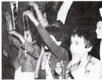
The visionaries hold up religious objects for the Virgin to kiss.

Everyone in the village or on the surrounding mountainsides will see it. The sick will be cured, sinners converted and the incredulous will believe. As a result of the MIRACLE, Russia will be converted. A permanent supernatural sign will remain at the pines after the MIRACLE until the end of time. If, after the WARNING and MIRACLE, the world still does not change, then the CHASTISEMENT will come.