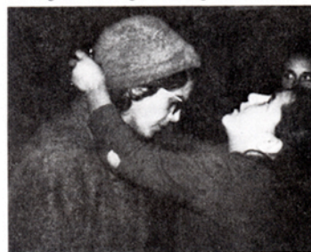
It was a moving experience for onlookers to have a medal or crucifix returned to them by the visionaries guided by the Virgin.